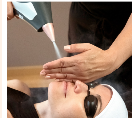
HONEA .03 Oval care