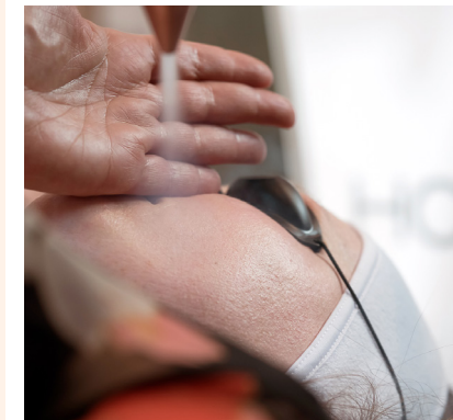
HONEA .02 Anti-puffiness care